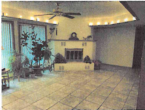
LIVING/DINING (WOOD FIREPLACE)

IF YOU ARE LOOKING FOR A LOW MAINTENANCE, ENERGY EFFICIENT HOME LOCATED IN THE RURAL AREA WITH EASY ACCESS TO TOWN. THIS IS A MUST SEE!!!!