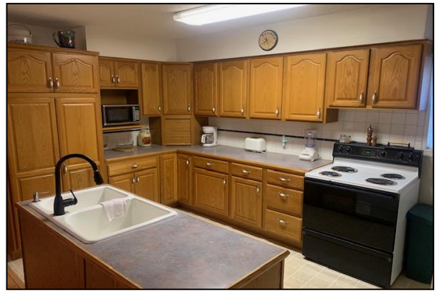
Stove, Fridge, W&D stay!