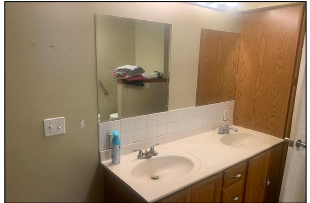
Double Vanity & Walk-in Closet