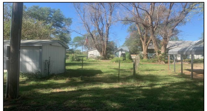
Big Open Area