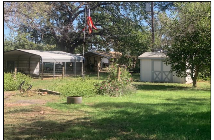
Sheds & Fenced Yard