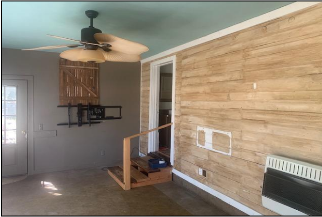
LR, TV Room