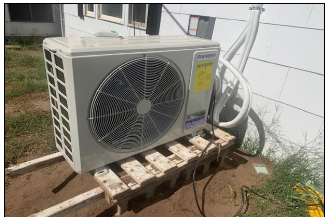
New Pioneer Ultra High Efficiency Heat Pump