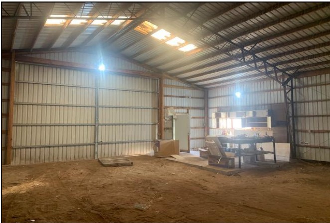
SE Interior of Shed