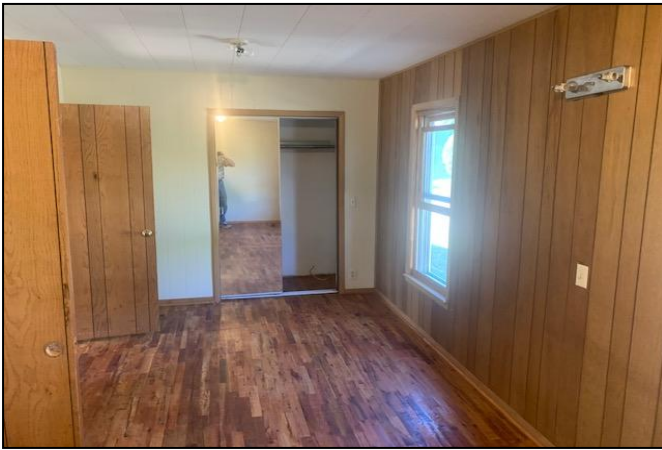
Big Master Bedroom