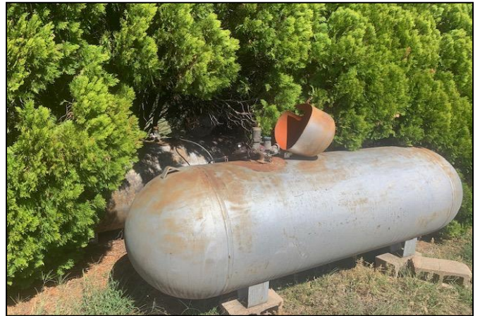
2 Owned Propane Tanks