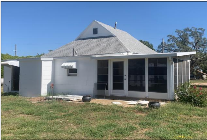
West View of House