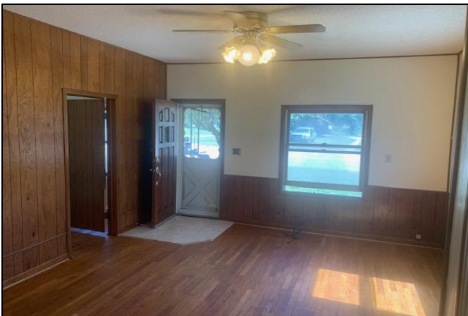
LR & Front Entrance