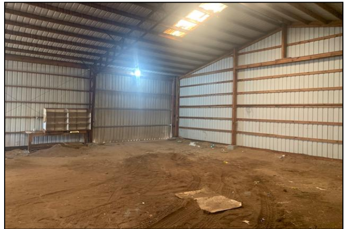
SW Interior of Shed