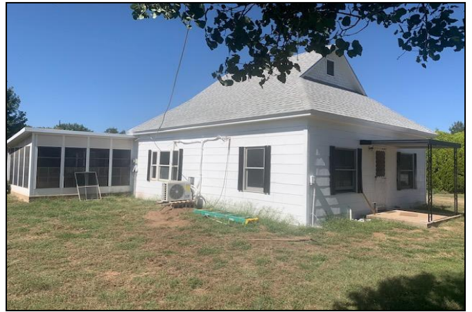
SE View w/ sun room