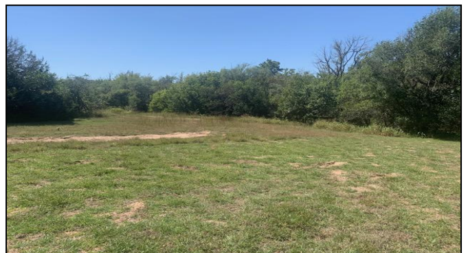
West Side of Property