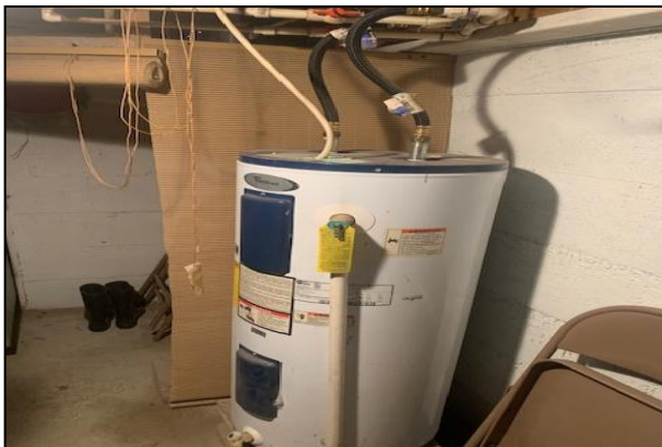
Hot water heater