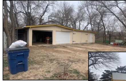
Lots of house and garaging!