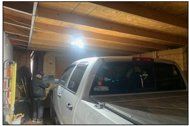
Inside 3rd garage