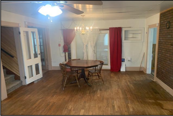
Dining area; wood floor