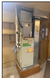
High Eff. Furnace