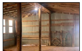
Room for pick-up, 4-wheeler, deer blinds, & feeders.