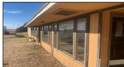
South Facing Pella Windows for maximum light