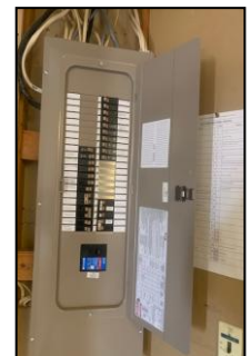
200 Amp Breaker Box