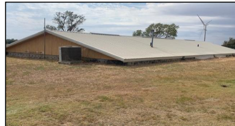
North Side of Berm Home