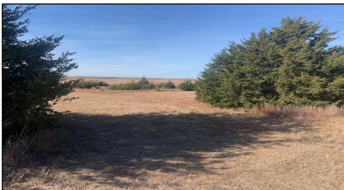
Trees and Grass