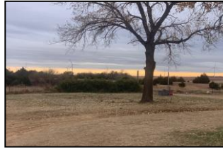
Prairieside view looking South!