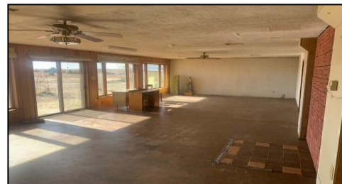
Big Great Room