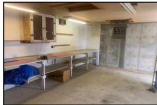
Interior of att garage